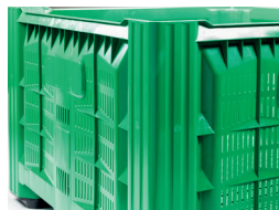
Reinforced supports & side walls