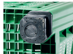
Simplified foot fixation means no more pins visible on the tie bar