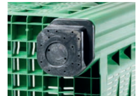
Simplified foot fixation means no more pins visible on the tie bar