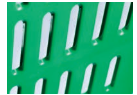
Rounded perforation edges