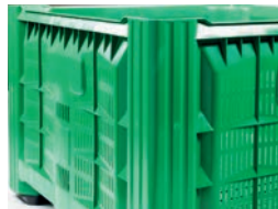
Reinforced supports & side walls